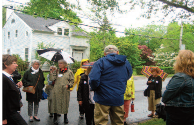
Stopping in front of Betty Friedan's home prompted a discussion on the impact of "The Feminine Mystique."

We all had a great time, despite deteriorating weather, with a torrential downpour while we were at lunch. All in all this was a very successful event. Some non-league members on the tour expressed interest in joining. That's another plus to such events, planned by the LWVH Special Events Committee, as well as promoting the League and raising funds.